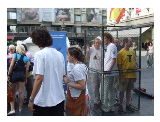
Performance in Knez Mihajlova Street "Torture does not recognise the nationality"