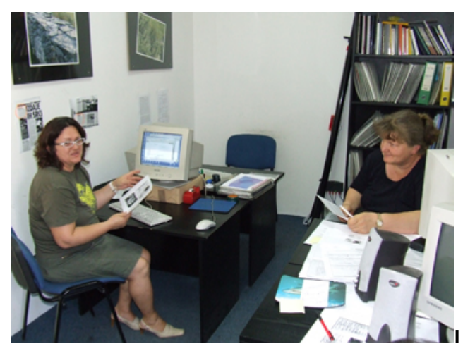
AN Lawyer provides legal assistance to a beneficiary in IAN office

The activities were realized through the Help desk established within the project Employed Empowered run by a partner organization. The legal advisor also performed field visits to different refugee settlements and collective centres in Serbia.