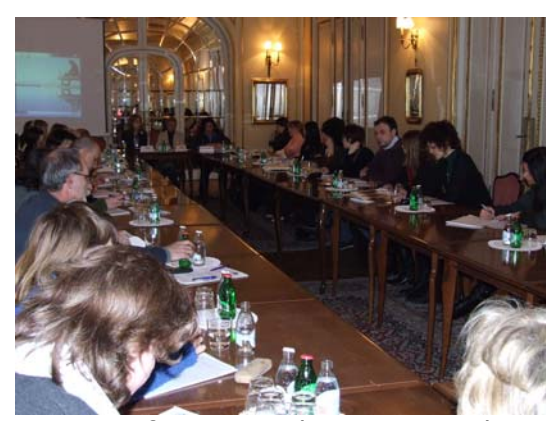
Seminar "Posttraumatic Stress Disorder as a Consequence of Experienced Torture – Psychiatric Aspects and Damage Compensation"