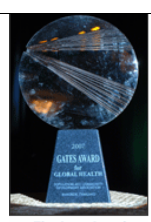
The Gates Award for Global Health

The Gates Award has been established to recognize an organization yearly that has made a major and lasting contribution to the field of global health and has substantively improved the health and the lives of people in need.