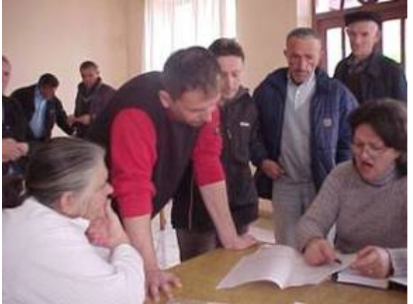
IAN Lawyer provides legal assistance to refugees in the field, September 2007

Information provided to beneficiaries included accurate and reliable facts on the situation in their places of interest, aimed at facilitating their decision on further steps towards durable solution.