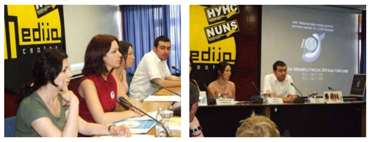
Press Conference on 26th June UN International Day of Support to Torture Victims

IRCT TV spot Together Against Torture was shown at the beginning of the press conference, as well as IRCT Photo presentation Renewing lives. IAN CRTV joined to the global reading of a statement signed by the UN Special Rapporteur on Torture and the IRCT's President and Secretary-General.<sup>2</sup> There were around 20 people at the press conference. The event had media coverage (presented in further text).