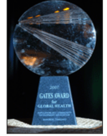
The Gates Award for Global Health

The Gates Award has been established to recognize an organization yearly that has made a major and lasting contribution to the field of global health and has substantively improved the health and the lives of people in need.