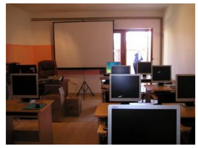
Classroom in the YPGD Education centre established within the Project in Vukovar, Croatia

http://www.ypgd.org/arhiva/article.php?id=387 . YPGD recruited two ICT trainers with experience in ICT and work with a group. IAN provided continuous support to YPGD regarding organisation and management of the ICT trainings. The partners from Vukovar received Syllabuses and programs for ICT education from IAN.