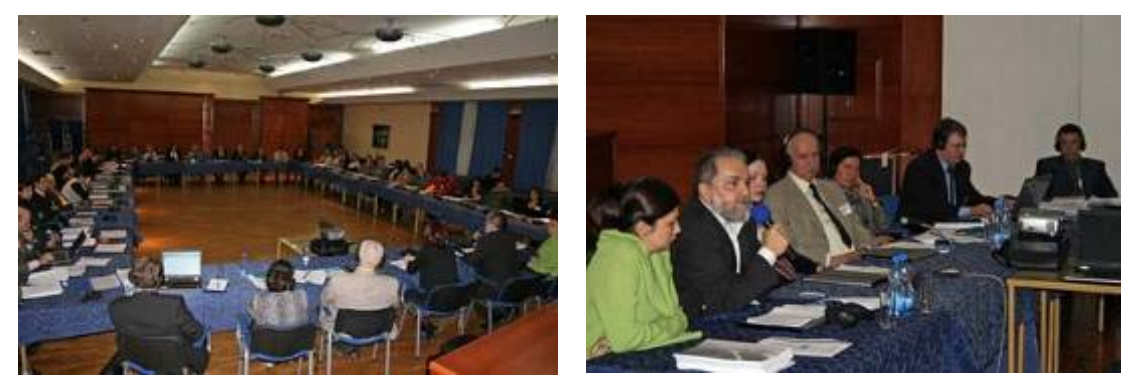
Photographs form the Istanbul Protocol Training

According to participants' statements and their answers in questionnaires, it can be said that there was a great need for this kind of training. There is significant number of torture cases or torture allegations that participants are in contact with, while their educational background is not sufficient to make them completely competent for doing adequate investigation and documentation of torture (there is no systematic education in trauma and torture related issues, neither for legal nor for health professionals).