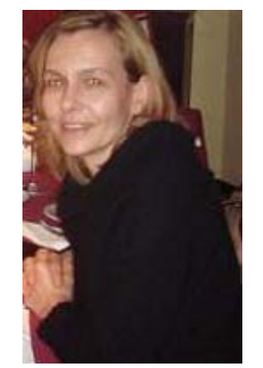
The X European Conference on Traumatic Stress, Opatija, June 5-9, 2007