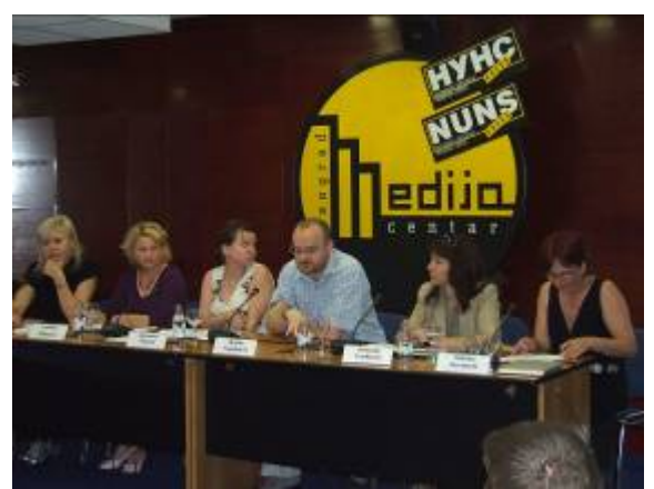
The project "Educative and psychological support to juvenile delinquents on the territory of Belgrade municipality" is focused on establishing models for implementation of these measures, through programmes of professional and psychological empowerment. Target group includes children who are in conflict with the law, juvenile delinquents who have been issued the order for special obligation by the Court.

The aim of the project is to establish new service that, through intensive education and psychosocial support program, encourages healthy development of juvenile delinquents, strengthens their personal responsibility, increases their educational level and by all this increases their chances for finding a job in future, and also decreases the probability of their recommitting criminal acts.